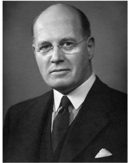
Figure 5. Sir James Patterson Ross Bt KCVO (Courtesy of Barts Health NHS Trust Archives and Museum SBHX8/977).

the anaesthetic; they jibbed at Churchill smoking cigars.