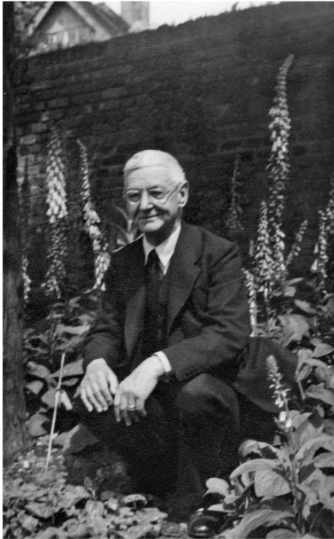
Figure 4. Sir John Parkinson

to my heart and heart consciousness'. Parkinson's conclusion was 'that there was no evidence of depreciation in the cardiovascular system and I believe that he is as good as ever. There is nothing to suggest that there is any particular cardiac risk at operation'. On 12 June, Churchill sent Parkinson a signed photograph with his good wishes.